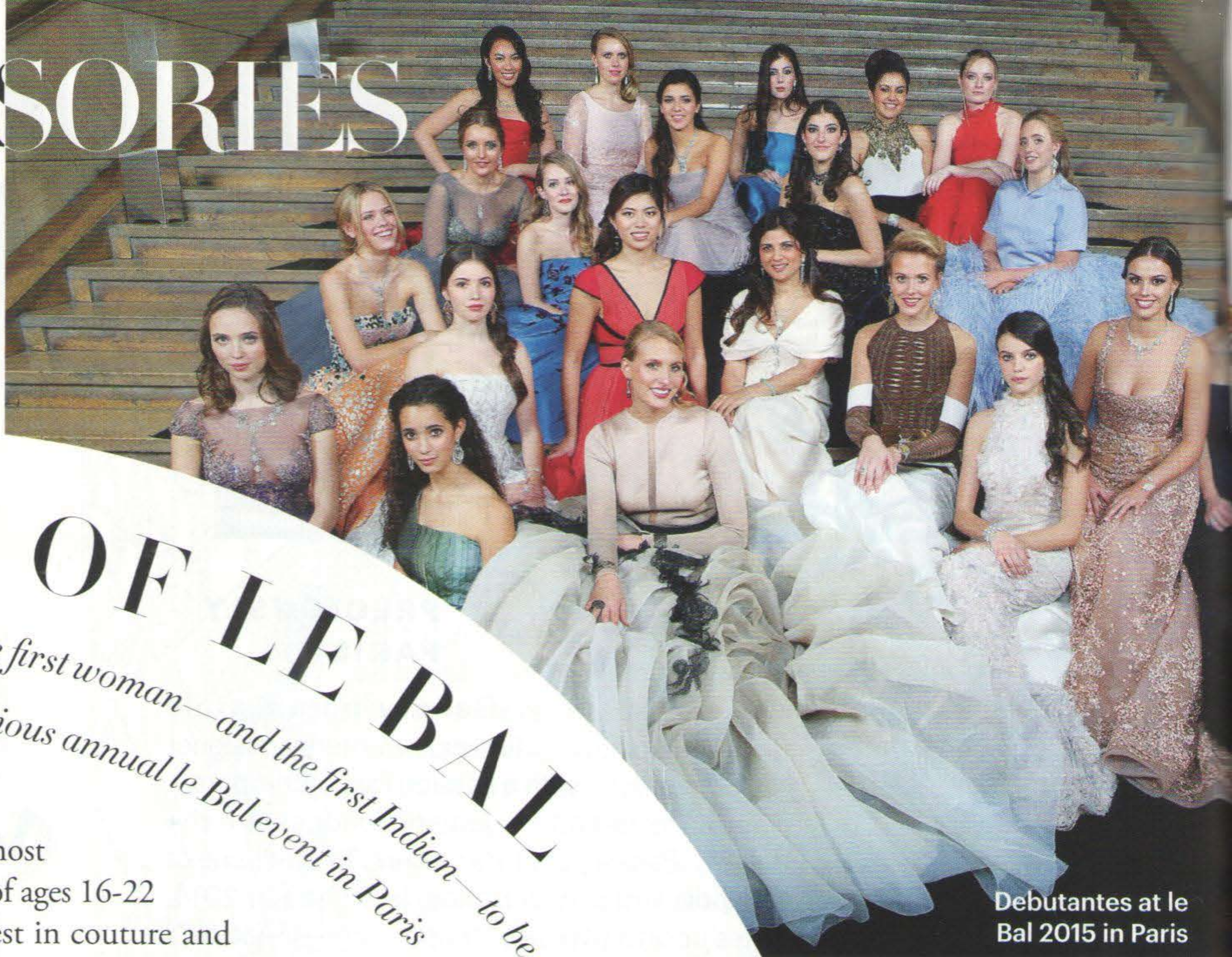
Debutantes at le Bal 2015 in Paris