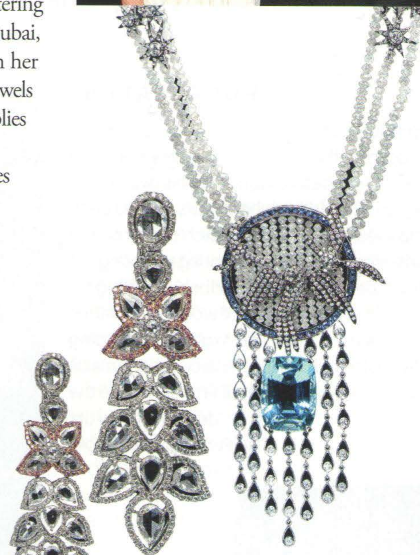
Payal New York jewellery, prices upon request.

JEWELLERY: PAYAL NEW YORK; LOCATION: HÔTEL DE CRILLON, A ROSEWOOD HOTEL; MAKE UP: MAC COSMETICS