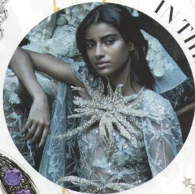
RK Jewellers pendant.