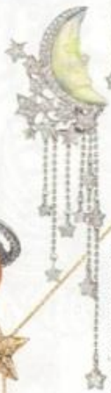
Lydia Courteille earrings.