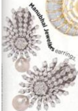
Manubhai Jewellers earrings.