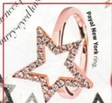
Papaj New York ring.

Sparkly jewels with celestial influences promise to turn your groom into a starry-eyed lover.